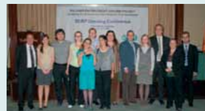
BERP Opening Conference in Skopje

The Balkans Enforcement Reform Project (BERP) supports the countries of the Western Balkans (Albania, Bosnia-Herzegovina, Croatia, Kosovo, Macedonia, Montenegro and Serbia) in ensuring a more efficient and effective functioning of the systems of enforcement law at the national and at the regional level. BERP assists in the reform of legislation, the training of judicial officers and professional organizations, the development and introduction of regional best practice manuals and the dissemination of reform efforts in the sector among the general public and other legal professionals.