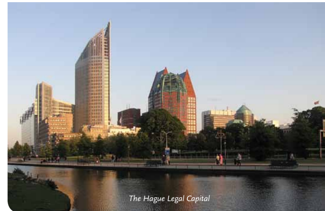
The Hague Legal Capital

E-mail: office@cilc.nl Website: www.cilc.nl