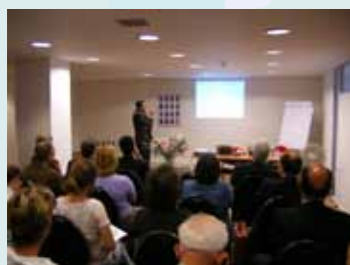
CILC Clinic, June 2009

providing peer-mentoring and on the spot coaching on various issues and daily practices.