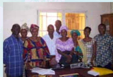
The transitional national board is preparing a national paralegal training program

CILC has conducted a unique project in which a national curriculum for the training of paralegals has been established. The national curriculum has been validated during a national conference by all important stakeholders, such as the Minister of Internal Affairs. After the conference training materials have been developed, the didactic skills of trainers improved and paralegals trained. In order to create uniformity amongst paralegals, all organizations involved in the training of paralegals have to implement the national curriculum.