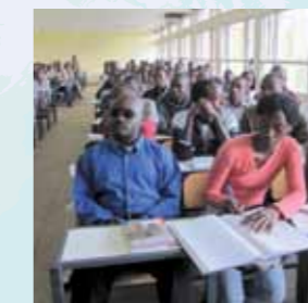
LLB students at the National University of Rwanda

The law faculties of the universities of Butare and Kigali in Rwanda have been jointly strengthened. The complete teaching staff have qualified and broadened their scope through LLM and PhD programmes in South Africa, the Netherlands, Ireland and France. The development of LLB courses within the framework of the new Rwanda module system, the investments made in didactic materials, and the adoption of a student-centred approach will all together contribute to a new generation of better-trained Rwanda lawyers.