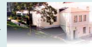
Estonian Law Center

In 2004 Estonia became a member state of the European Union. In order to assist in implementing EU legislation, CILC has worked together with the Estonian Law Center Foundation to train Estonian judges, prosecutors and their trainers in this extensive and challenging field of law. Among other things innovative materials for computer-based distance courses have been developed.